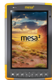
NEW! The Mesa 2

Mesa 2 an office in ANY ENVIRONMENT! In a sleek package with the highest-rated protection against water and dust, the Mesa 2 Rugged Tablet can go with you into the log yard and the harshest environments out there.