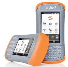
The Archer 2

Archer 2 is designed for ease and accuracy. A perfect complement to the YardMaster2020 system. The Archer2 is rugged, waterproof and shock proof, all with an easy to use touchscreen and back-lit keypad allowing for easy set-up.