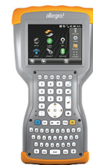
The Allegro 2

The Allegro 2 is as rugged as they come! Which means you'll never have to worry about it letting you down. Designed for all-out data collection, the Allegro 2 features a full QWERTY & numeric keyboard, carefully selected for its ergonomic form.